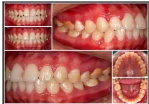
Figure.1 Digital intraoral photographs were taken by professional doctors using cameras with auxiliary tools.

Two methods were used to evaluate the malocclusion status of 31 volunteers: Method 1: clinical examinations combined with the panoramic radiographic examination (CE); Method 2: intraoral digital photographs examinations (IDPE). To ensure the interexaminer consistency, a pre-test was carried out before beginning the study to calibrate the consistency of the two dentists, and the test results were relatively consistent ( \kappa > 0.75 ). In the first stage, two dentists performed CE of all the study subjects, and timekeepers recorded each volunteer's examination time. At the same time, dentists used flash-equipped DSLR cameras (Canon 6D with a lens of EF 100mm f) and auxiliary tools such as hooks and reflectors) take intraoral digital photos of each volunteer (Figure 1) and ensure volunteers close the bite in the proper position. A month later, the same two dentists examined the intraoral digital photographs collected before using IDPE, they were not allowed to enlarge or resize the photos, and timekeepers recorded each volunteer's examination duration.