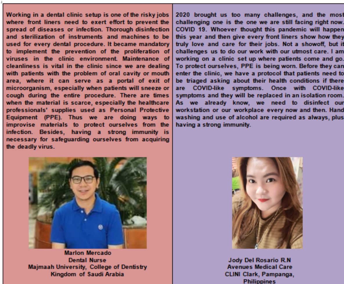
Figure 3. Opinions of the dental nurses from the Kingdom of Saudi Arabia and the Philippines.